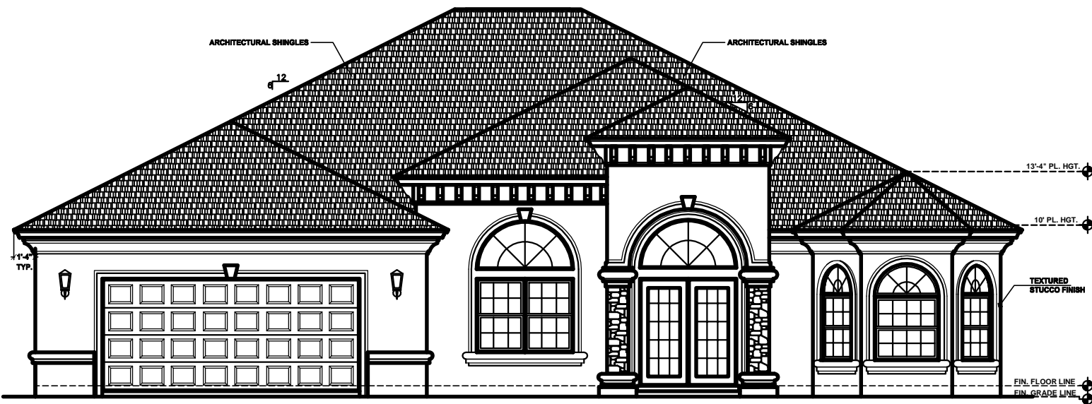
Plan 2559 Opt. "B"