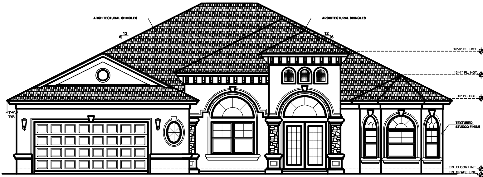
Plan 2559 Opt. "A"