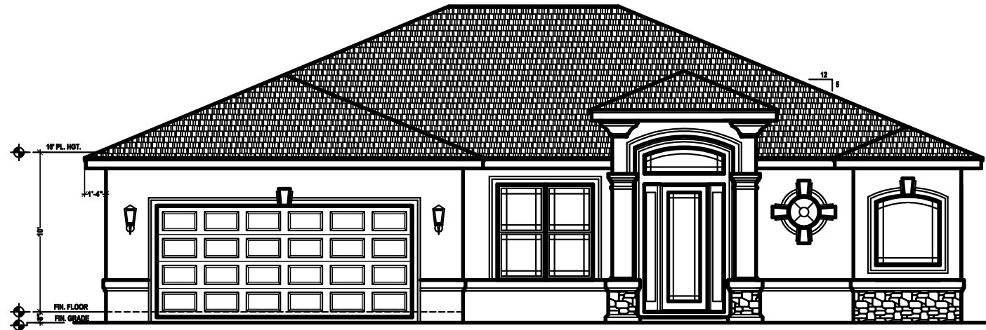
Plan 1976 Opt. "C"