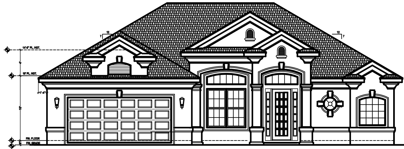
Plan 1976 Opt. "B"