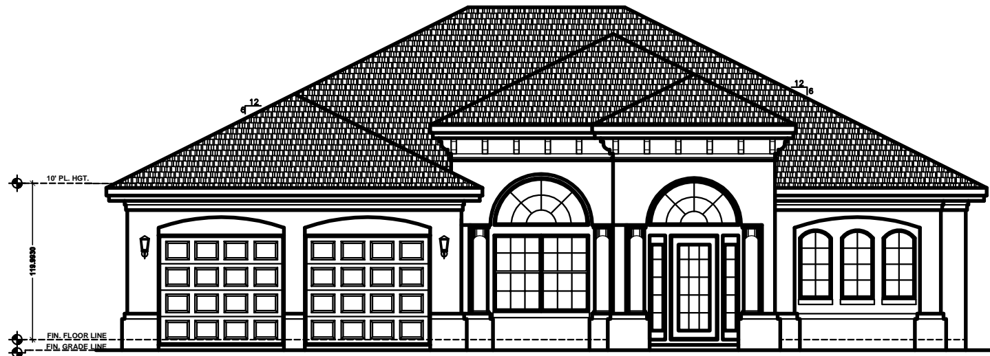
Plan 1976 Opt. "A"