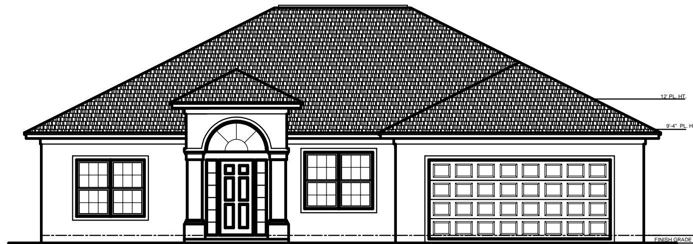
Plan 1859 Opt. "C"