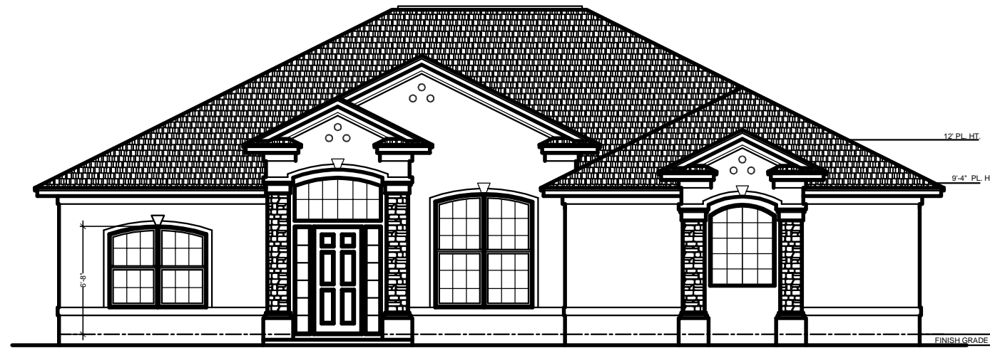
Plan 1859 Opt. "A"